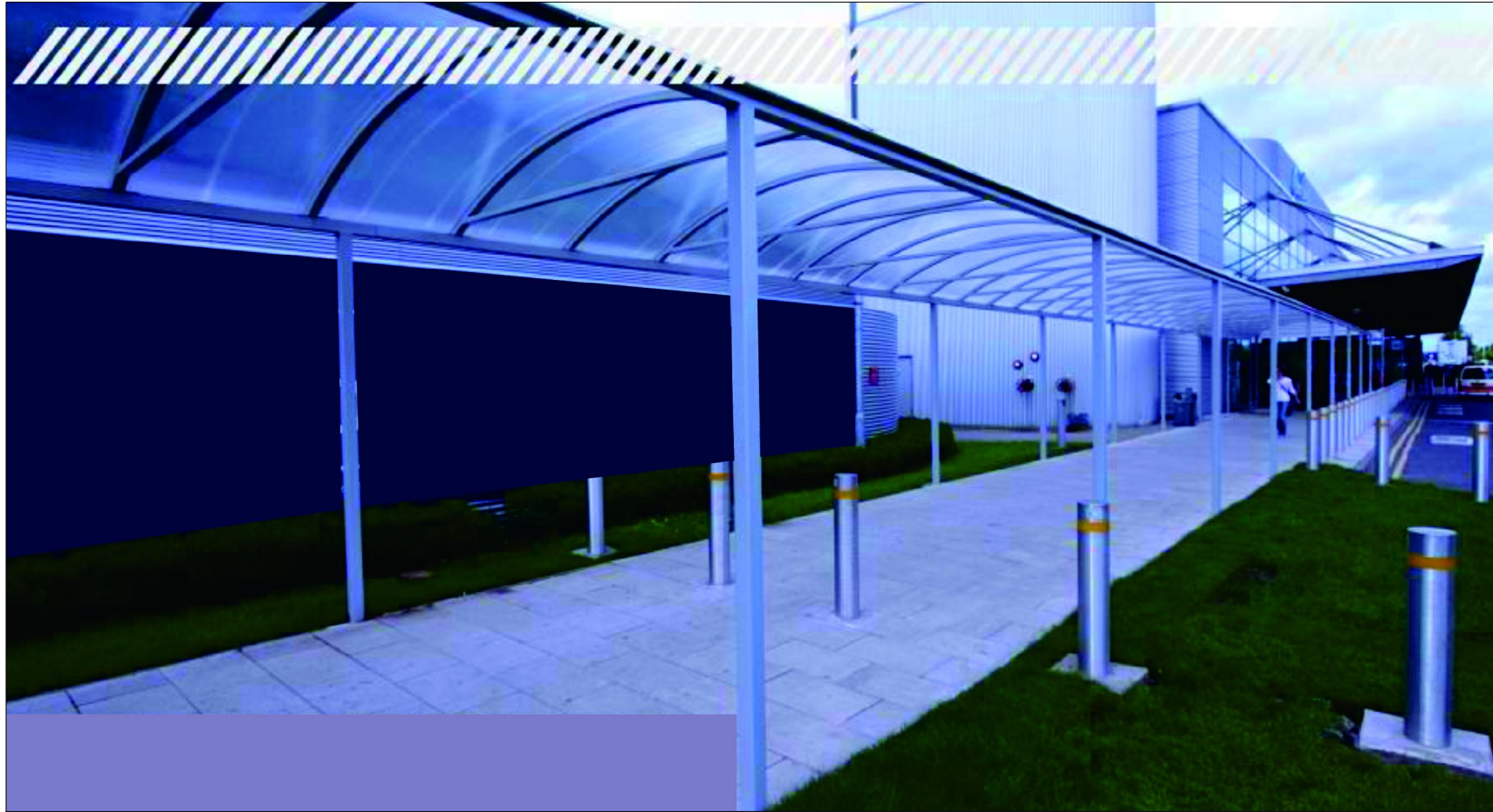
COVERED PATHWALK OPTION - 2 FOR DORMITORY-2 BLDG. TO PROPOSED ACADEMIC BLDG. 2